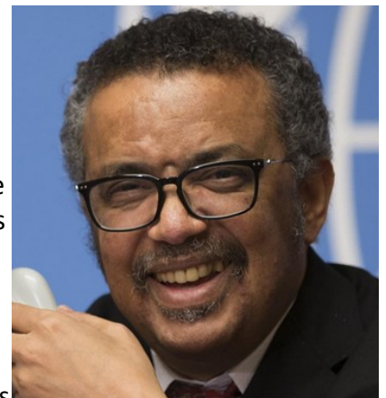
Public WHO Screenshot

It is now clear that the Pandemic inflicted upon the world had its roots in the Obama White House with beginnings of COVID development on the Campus of University of North Carolina. Changing regulations resulted in the transfer of the lab studies off shore to Wuhan, China. This was accomplished with the participation of Anthony Fauci along with US funding. In conjunction with this activity, the Chinese Communist Party (CCP) was influential in having Tedros Adhanom Ghebreyesus, a known radical Ethiopian Communist, who held power in Ethiopia as a member of the Tigray People's Liberation Front was appointed the WHO Director General. During this time frame the WHO changed the definition of a pandemic. Eliminating the death requirement. It is what enabled. Doctor Tedros, as he is called, to declare the COVID 19 release a Photo pandemic.